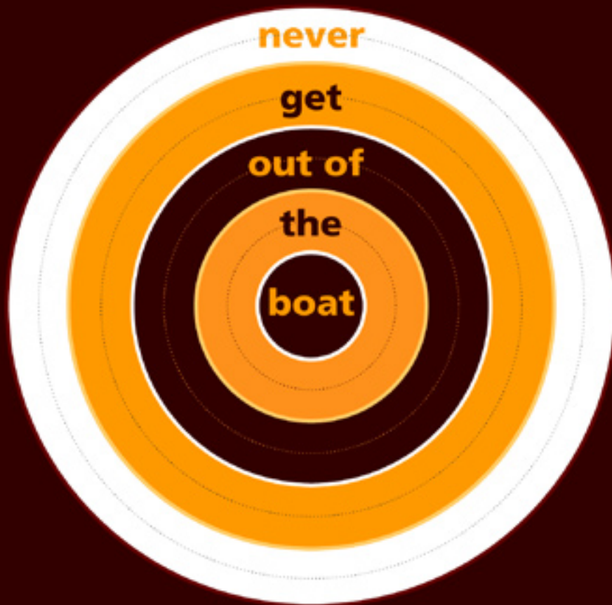
Apocalypse now (1979)