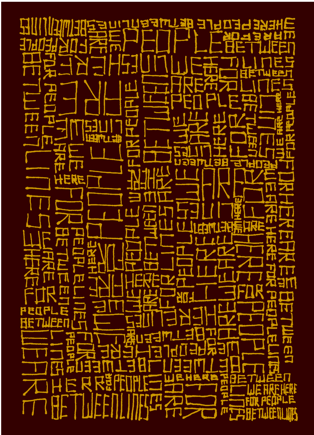
No man's land (2001)